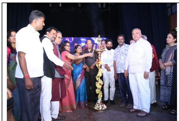
Inauguration of the Convention by Dignitaries